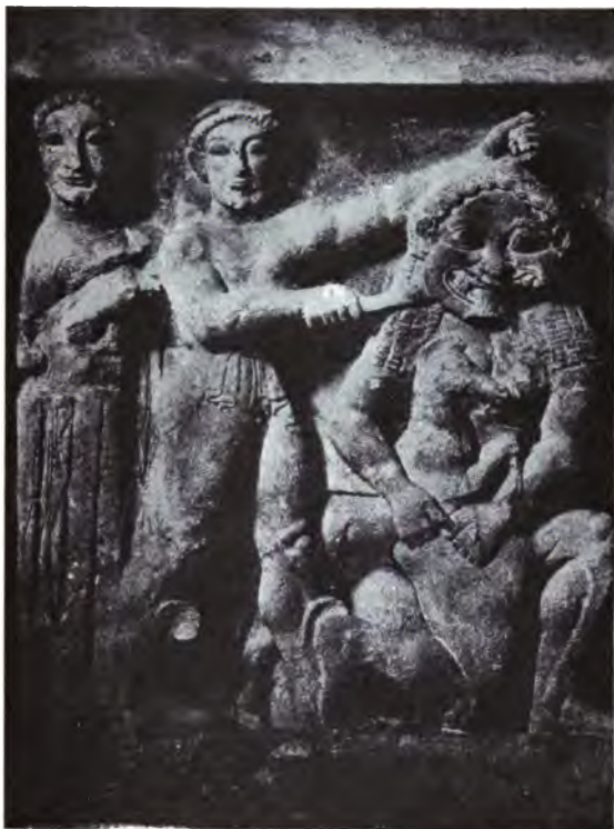
Fig. 62. Perseus killing Medusa.

shore, were sleeping the gorgons, Medusa and her two terrible and immortal sisters.